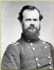
General John Bell Hood (CS)